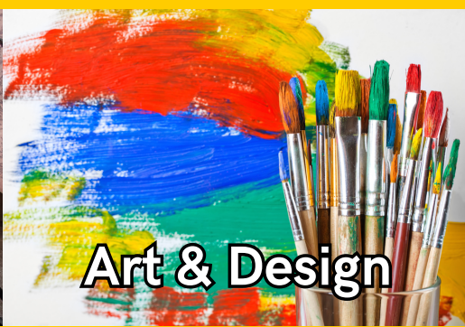
Art & Design