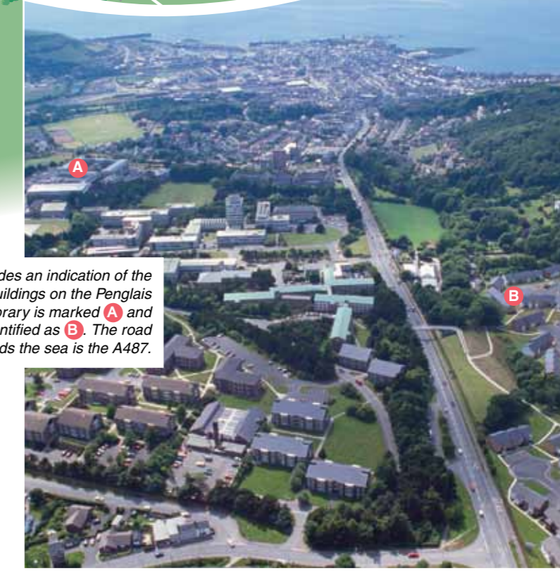
This aerial view provides an indication of the location of most, not all, buildings on the Penglais Campus. The National Library is marked A and Pentre Jane Morgan is identified as B . The road running towards the sea is the A487.