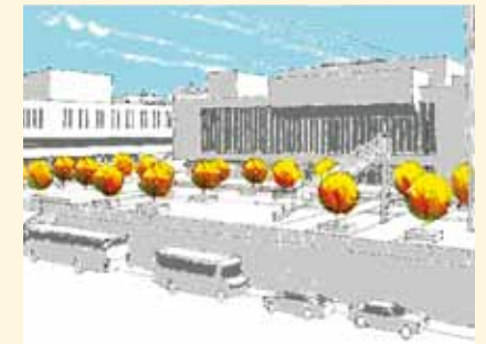
The Piazza Phase 1

This project will be completed by graduation in July 2010.