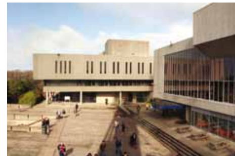
The Piazza in front of the Arts Centre

The focus of this year's Annual Fund environmental project was to enhance the Piazza in front of the Arts Centre.