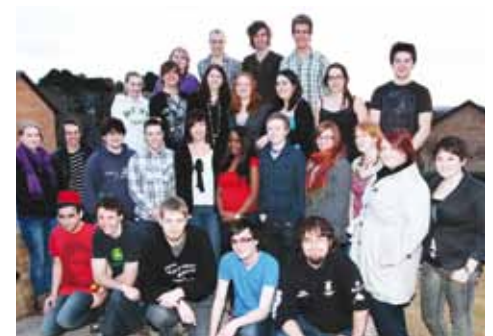
Part of the telephone calling team

As a result of this warmth felt towards the University, the projects we announced at the start of the academic year have not only been fully funded but also implemented. Our sponsored PhD student arrives in September, the IT project is nearing completion, the Student Hardship Fund is now a reality and the improvements to the Piazza will be completed over the summer.