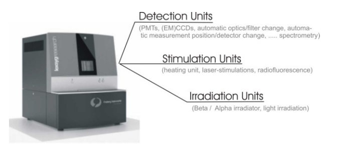
Figure 1: lexsyg - luminescence measurement system.