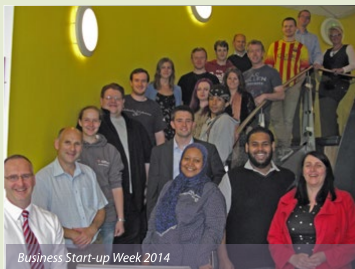
Business Start-up Week 2014

For details of upcoming enterprise events open to students, staff and graduates, please visit www.aber.ac.uk/crisalis , or find us on www.facebook.com/AberUni.Enterprise .