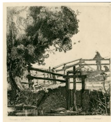
'The Sluice Gate', etching, 1924, purchased from The 21 Gallery