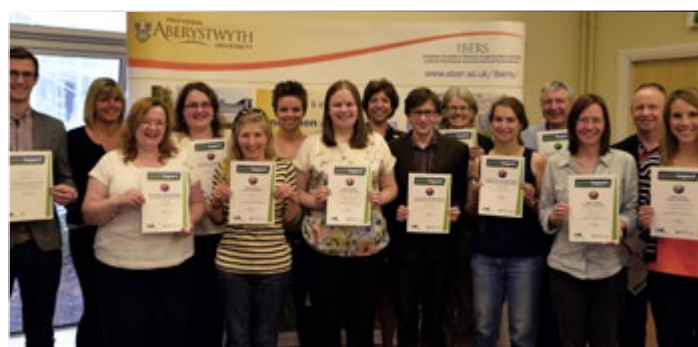
Green Impact Award Winners