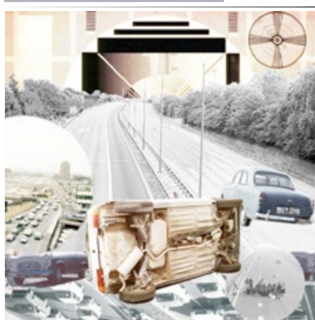
'Re-enchantment 1', Reuben Knutson