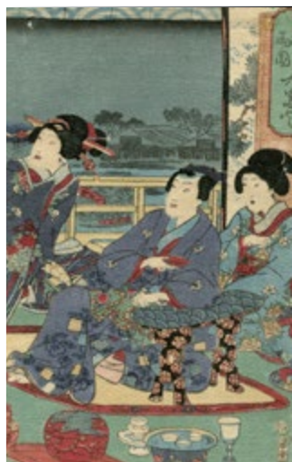
Japanese woodblock print on silk, 19th century