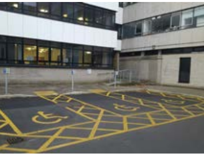
Fully accessible car parking spaces between the Cledwyn building and Student Welcome Centre