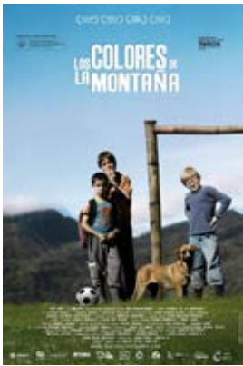
The Colors of the Mountain , part of the WOW Film Festival