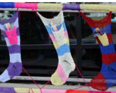
The colourful display outside Hugh Owen Library brought Christmas cheer with a combination of yarn, lights and bells.

A 'yarn bomb' created and installed by Grym Gwau-Knit Force brought festive cheer to the area outside the Hugh Owen Library shortly before Christmas.