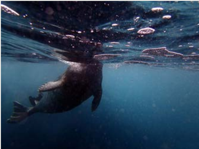
Below: Kerry's photo of an inquisitive seal with weeds balanced on its nose was commended in the BSAC Great British Diving photo competition.