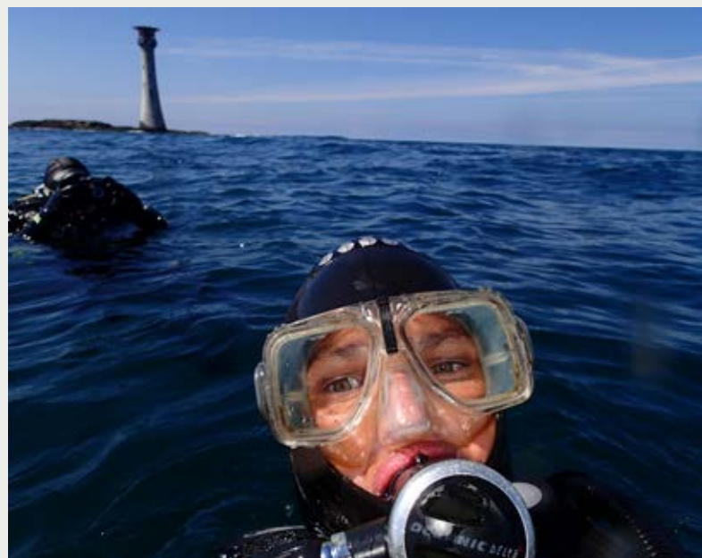
Above: Kerry at The Smalls Lighthouse, 20 miles west of Marloes Peninsula in Pembrokeshire