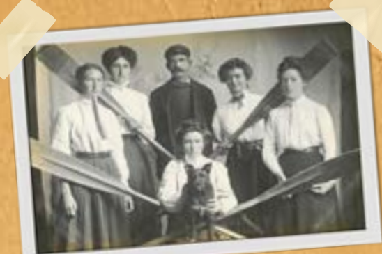
Tîm Cychod Merched, c1909. Byddwch wyliadwrus o'r ci!

We are always on the lookout for more photographs, particularly from the 1970s onwards, so please join the conversation and share your memories with us: