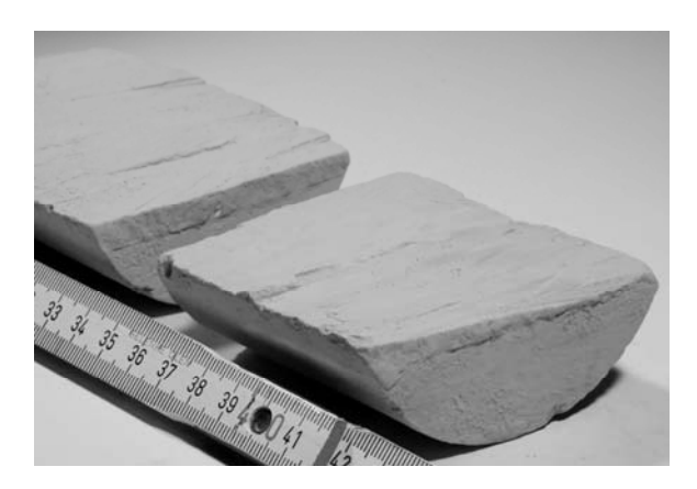
Figure 1: Azzano Decimo core, samples ADC18 and 19. Samples were between 8 and 20 cm in length, and only taken from those parts that remained completely consolidated.

A sedimentary core, drilled four years earlier in Azzano, northeastern Italy, was sampled for luminescence dating in 2006. The core was 260 m long, with the top lying only 9 m above sea level (a.s.l.), and composed of sand, silt and clay sediments, of which only the consolidated silty sediments were sampled (Fig. 1). As it had been exposed to air during storage almost all the water originally present had evaporated.