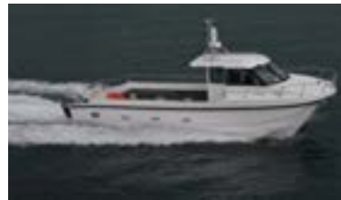
The Cheetah 9.95m: One of our new research vessels

Lectures in 'Surveying Aquatic Environments' will focus on the legislative framework underpinning environmental conservation in the UK and Europe, before exploring techniques for sampling aquatic habitats, such as grabs, trawls, remotely operated vehicles, and electro-fishing. Students will put these skills into practice during a field week where extensive use will be made of our two new research vessels, giving them hands-on experience of techniques used by professional aquatic biologists. The module will not only be fun and educational, but will equip students with the confidence, skills, and knowledge to work in aquatic conservation.