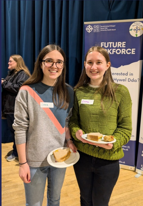
CRS students at a networking lunch with local employers

Opportunities to meet individuals from a wide variety of businesses and organisations through Meet the Professional sessions