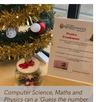
Physics ran a 'Guess the number of sweets in the jar