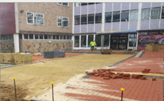
Physics Main Entrance

We hope that new and returning students and staff enjoy the benefits of the investments that have been made to the University estate.