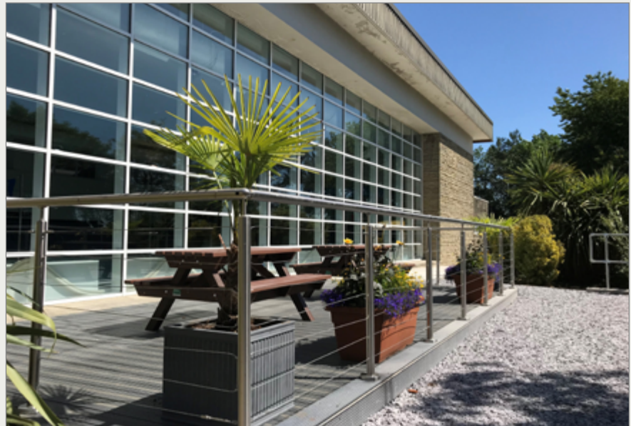
New outdoor seating area at the back of the Sports Centre

Refurbishment of our domestic property portfolio has also been carried this year, and the rental income the University now receives has benefited considerably from this work. A visible example of this is Penglais Lodge, which sits at the entrance to Plas Penglais. The Lodge had been derelict for a number of years but, following internal and external renovation and reconfiguration of the