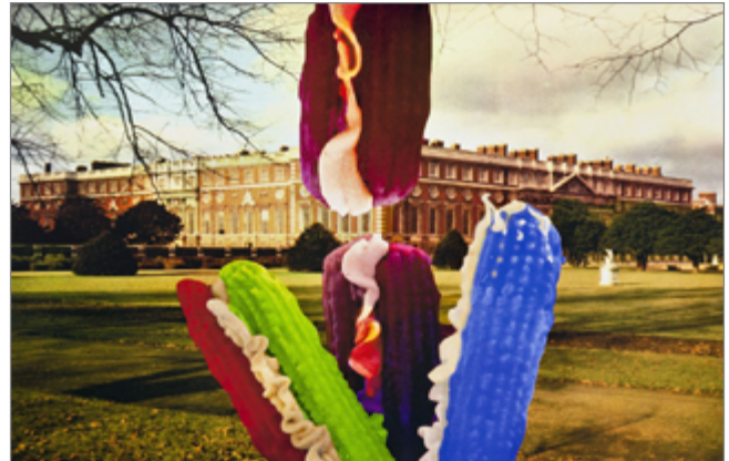
'Connected Forms. White marble, resin and paint', David Ferry, 2015/16, Screenprint. Part of a series 'Public Sculpture in England' on loan to the National Trust.

Outdated picture guidebooks that portray an idealised landscape are the raw material for David Ferry's artworks. The pictorial books that Ferry uses are found in high-street charity shops. Slightly battered and discarded by their former owners, they show a Britain before the decline of recent decades.