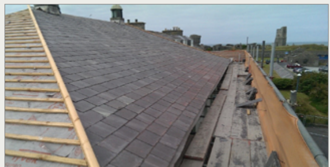
The roof of 10 Laura Place.