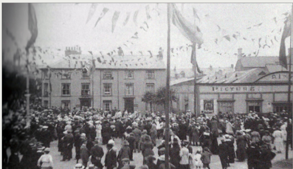
The Rink cinema which opened in 1913 in the Aberystwyth's old skating rink, located across from the current town library.

I also found it a challenge adapting to a work schedule that I had to set for myself, especially coming from full-time employment. I've found I have to treat myself a bit like a toddler and give myself rewards for good behaviour. For example, "you can watch one hour of Netflix over lunch if you write 1000 words before 1pm".