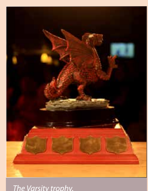
The Varsity trophy. Credit: Joseph Landers (2013)