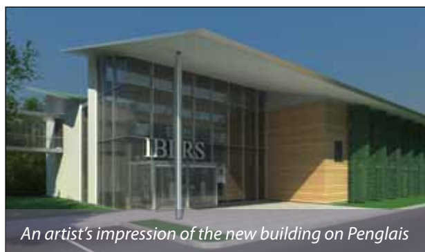
An artist's impression of the new building on Penglais

It will also become the centrepiece of a new Institute for International Plant Breeding that will include a laboratory