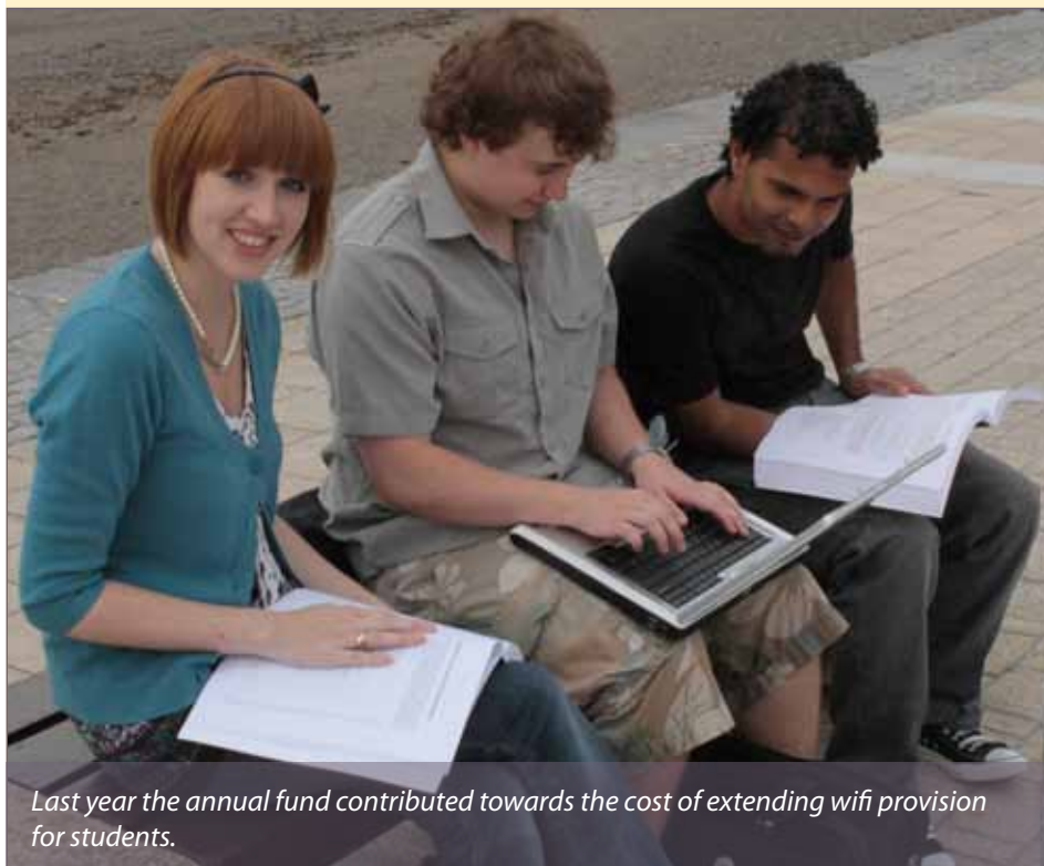
Last year the annual fund contributed towards the cost of extending wifi provision for students.