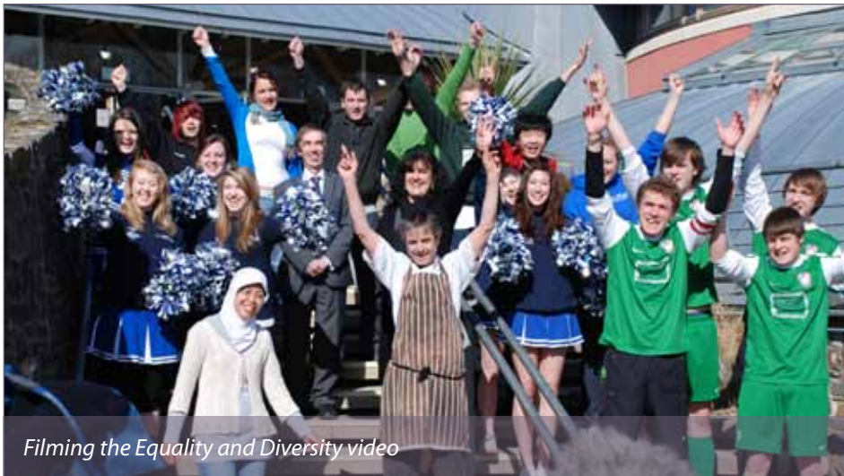
Filming the Equality and Diversity video

With more than 8,500 students and 2,000 members of staff from over 100 countries across the globe, it should come as no surprise that the University here at Aberystwyth is home to such a rich and varied community.