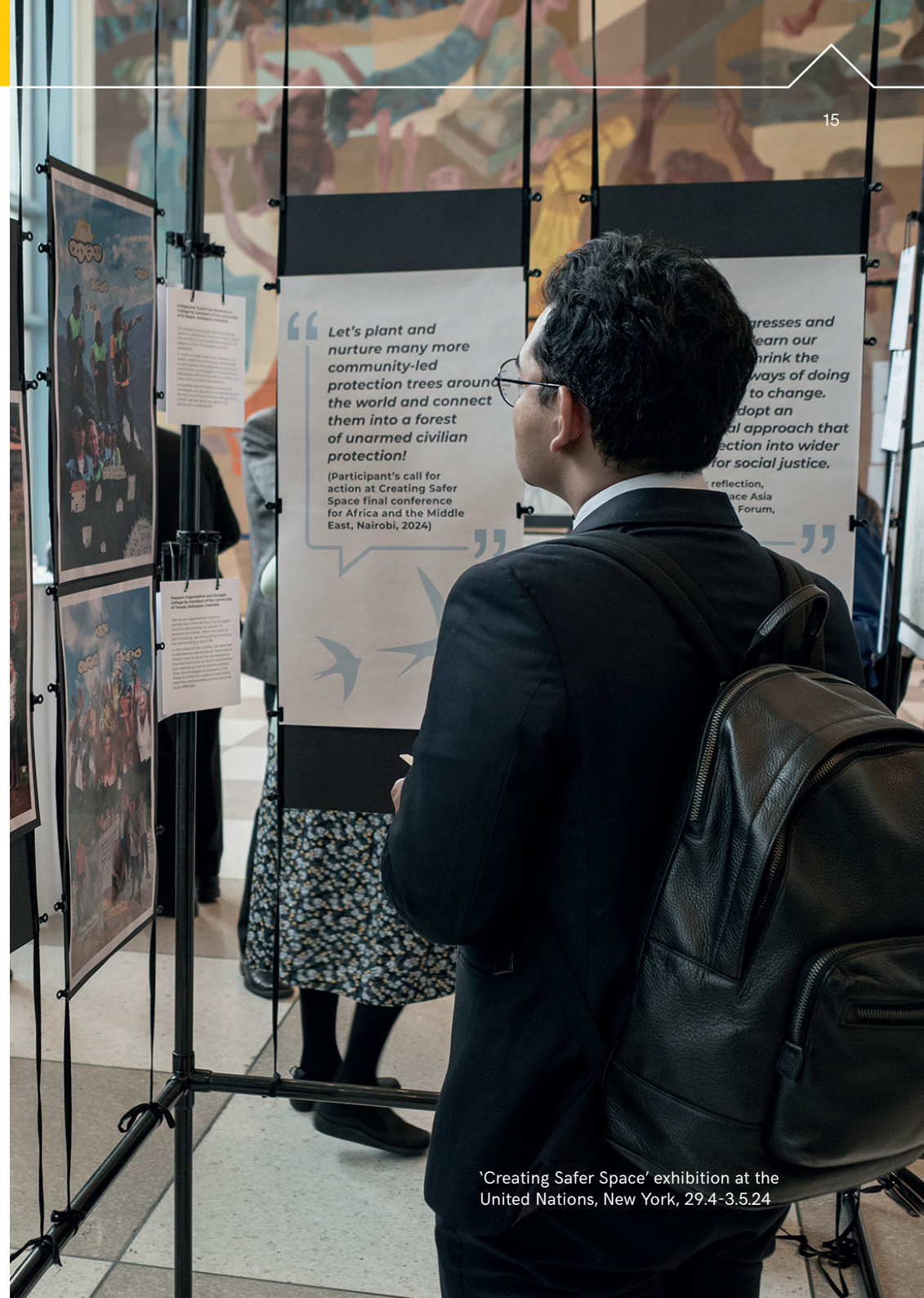
'Creating Safer Space' exhibition at the United Nations, New York, 29.4-3.5.24

At Aberystwyth Interpol you will benefit from the latest thinking, exploring and testing of new ideas on international politics!